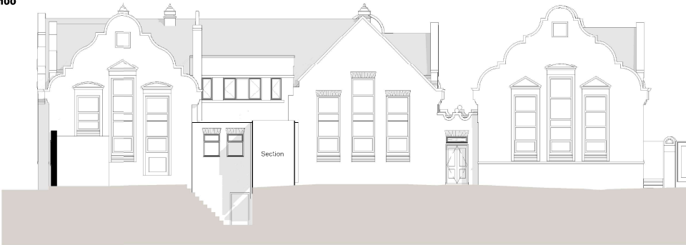
GA Elevation - F - Existing 1:100