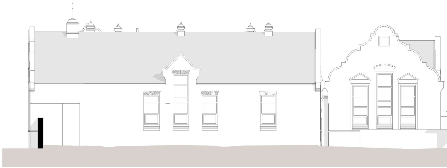
GA Elevation - D - Existing 1:100